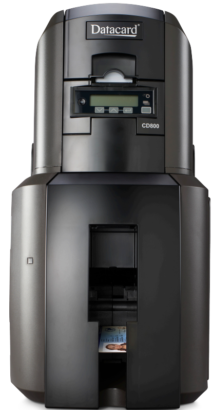
Datacard® CD800™ Card Printer with inline lamination module