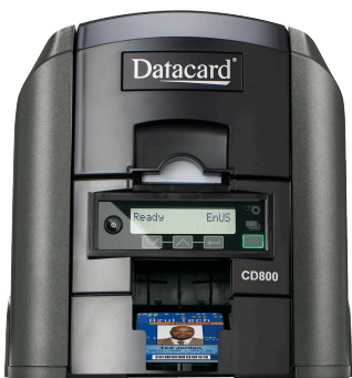
Datacard® CD800™ Series Card Printer